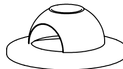
ASH DOME LID